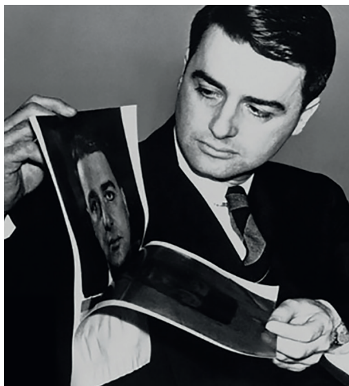
Edwin Land debuts the film for what would become the Polaroid instant camera at a 1947 OSA meeting.