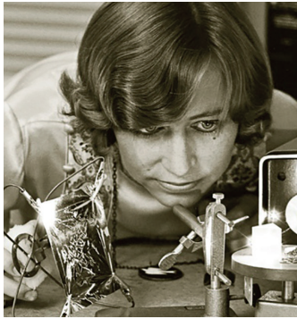
Elsa Garmire, c.1969, patented devices that enhanced optical communications including lasers, waveguides, and detectors. Garmire served as OSA president in 1993.

The Optical Society reflects on its achievements in the last 100 years.